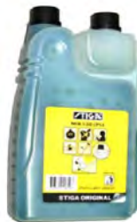
ULJE DVOTAKTOL 1L SA MERICOM