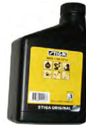
ULJE DVOTAKTOL 1L BEZ MERICE