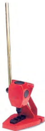
MAŠINA ZA RASTAVLJANJE LANACA